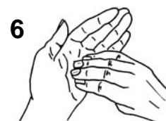
6 Rotational rubbing with clasped fingers

For advice about infection control in this area, contact any of the PCT's Infection Control Nurses: