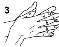
3 Rub with fingers interlaced