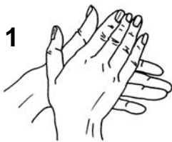
1 Rub palms together