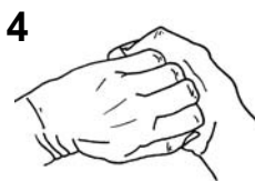
4 Rub with fingers interlocked